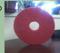
Scrubbing machine and floor pad.