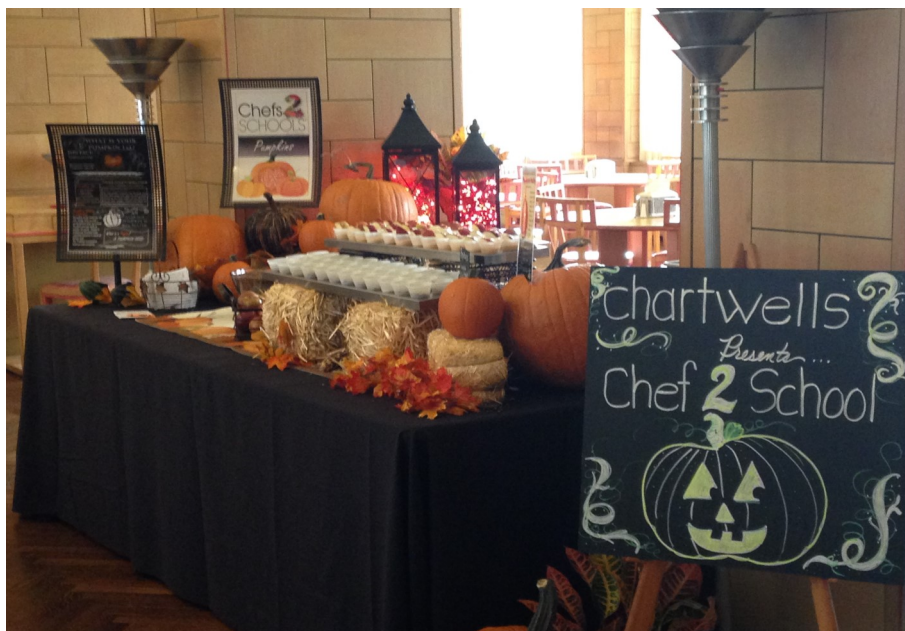
Photograph: Chartwells Chef 2 School Program at Cranbrook School Dining Hall